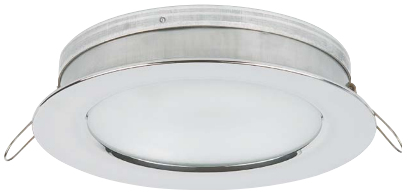
Avalon 155 PowerLED