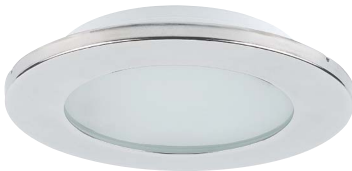
Tacoma 155 PowerLED